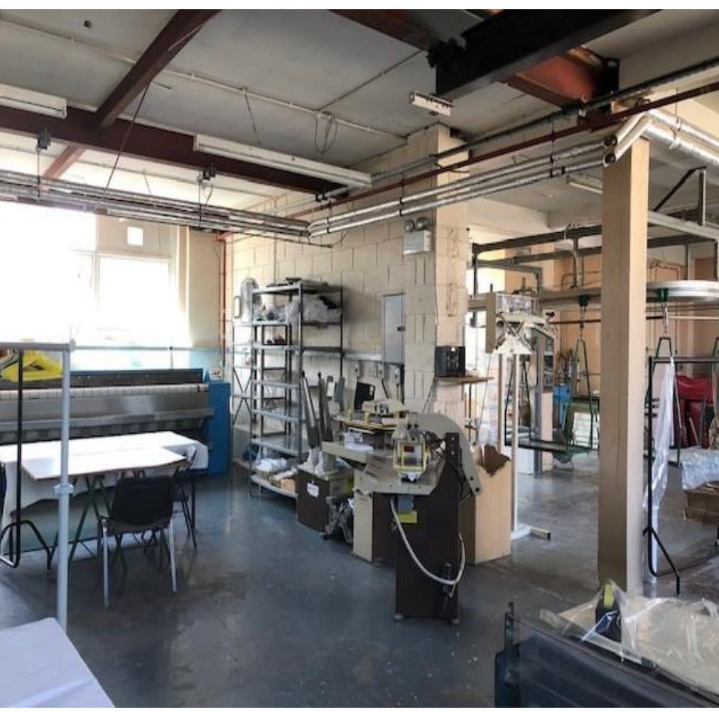
KITCHEN / PRODUCTION AREA